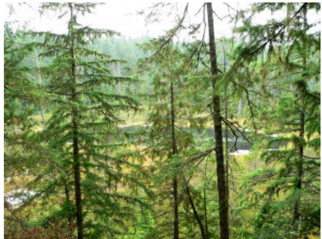
Triangle Lake, seen from the new trail