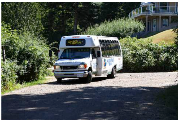
The Wood Duck Bus from the Iris Griffith Centre

Thanks to the Iris Griffith Centre for bringing the