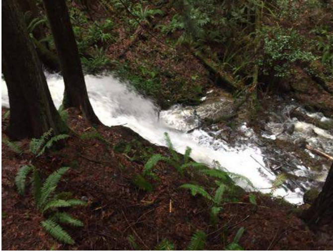
The Colvin Creek Falls are worth a short walk during and after some of these heavy rain events.