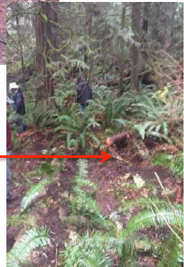
A log berm was covered with dirt and ferns to direct water parallel to the trail