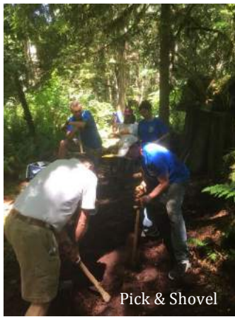
Pick & Shovel

“We thought SBS would be a fitting recipient for a donation given the park's location nestled in both a fresh and salt water setting and the connection the park has with locals and visitors. “