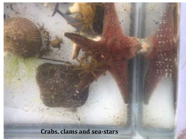
Crabs, clams and sea-stars