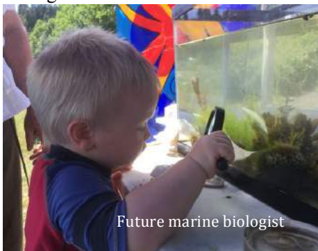
Future marine biologist

This year one goal was to keep an eye out for the invasive Green crab, Carcinus maenas . It was not seen!