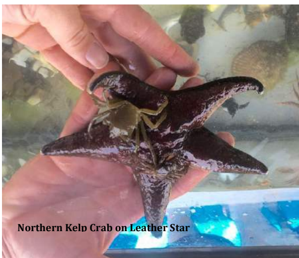
Northern Kelp Crab on Leather Star