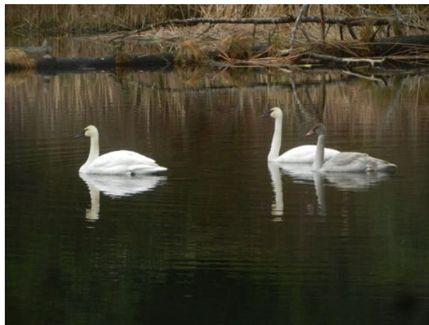
(Photo of 2 adult and 1 juvenile Trumpeter Swans, Dec. 28, 2019)

Watch for membership renewal reminders arriving by email in the near future – please renew promptly and encourage your friends to do the same. If you do not get a reminder, you are paid up to date.