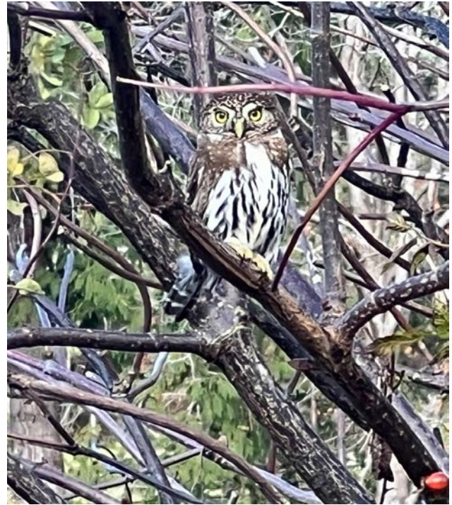
Northern Pygmy-owl on the berm at Sargeant Bay, Nov 22, 2023 – Dave Spicer

A few coho have been seen arriving this fall. October 18th was the first day a coho was seen going up the fish ladder in the park. A Harbour Seal was seen chasing the salmon in the estuary below the fish ladder on the week of November 20th. A incoming high tide is the the best time to possibly see the returning salmon. There is once again a notebook on the bridge to make a note if anyone has anything to report. The Sargeant Bay Stream Keeper volunteers continue to monitor and clear the beaver debris at the top of the ladder each day until the end of December. The Chum salmon are usually late in the season, so we hope to see some return soon on big rain days.