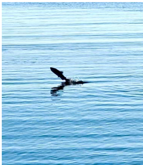
Coho salmon jumping in Sargeant Bay, October 2023 - Dave Spicer

If you photograph any interesting events or activities in the Park, please send along for inclusion in the Newsletter, with a short description of what you saw.