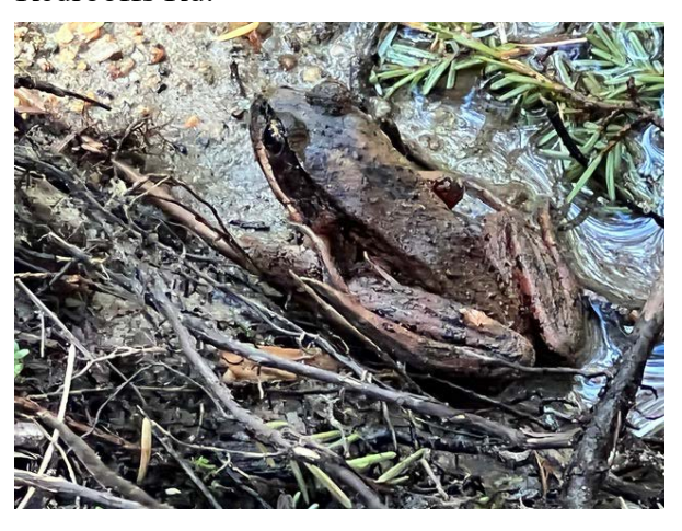
The Coastal Tailed Frog is by far the least known while the Pacific Chorus Frog is surely the most vocal.

If you photograph any interesting events or activities in the Park, please send along for inclusion in the Newsletter, with a short description of what you saw.